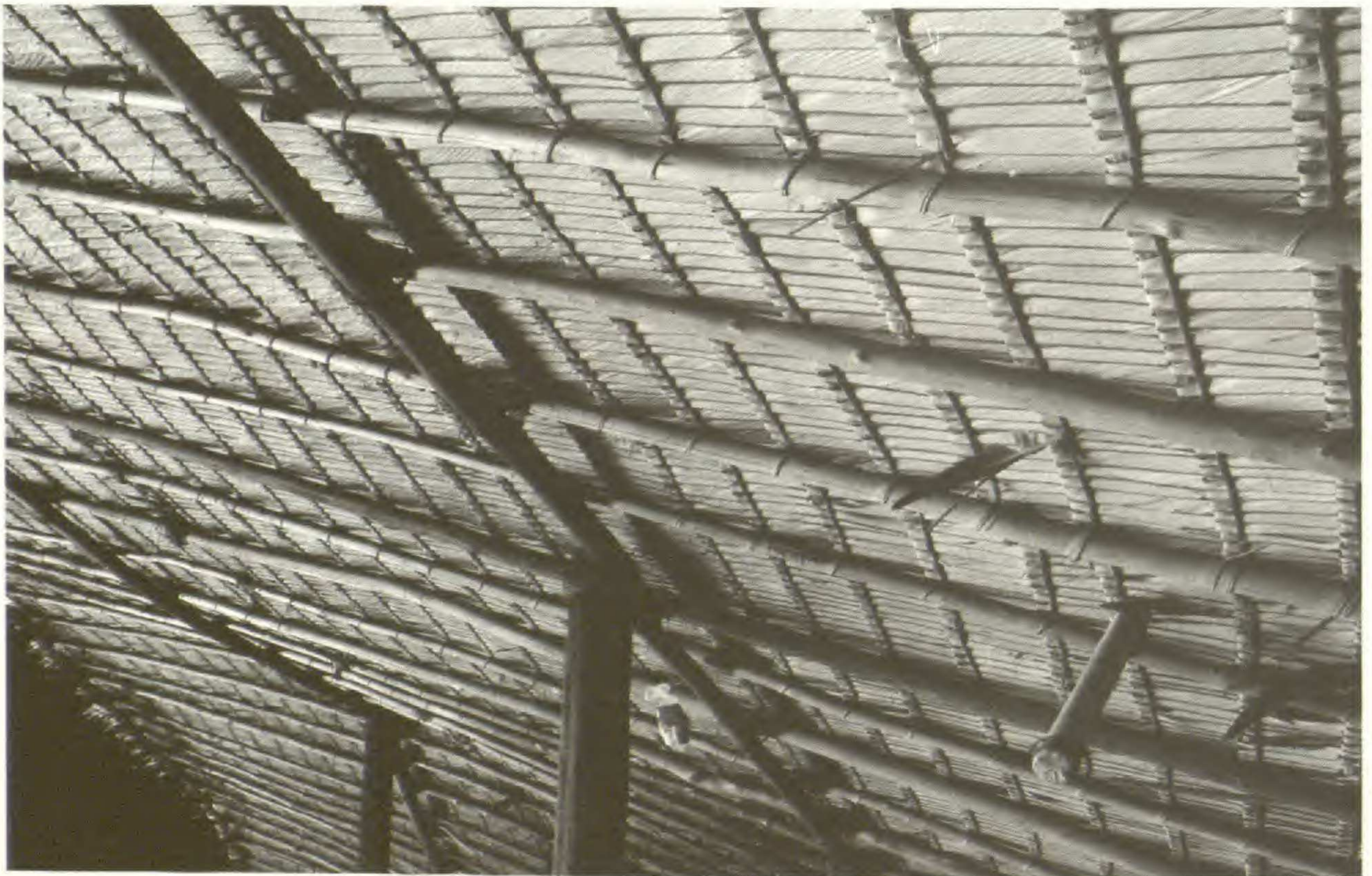
FIGURE 6.—Detail of the thatch at Watoriki . Note the slender Socratea wood slats around which the individual leaves are folded, visible at the top right of the picture. Each leaf is folded double at the midrib (at the edge furthest from the camera).

nents together. The aerial roots of the epiphytic climber Thoracocarpus bissectus and the stems of the lianas Callichlamys latifolia and Arrabidaea sp. were also said to be suitable for this purpose. To thatch one square meter of roof, approximately 160 Geonoma leaves are used, and an estimated 500,000 leaves, calculated by estimating the roof area, were used for the whole building. To prevent the small leaves from being displaced or damaged in strong winds, the leaves of the larger palms Maximiliana maripa and Jessenia bataua are attached (vertically) on top of the Geonoma thatch.